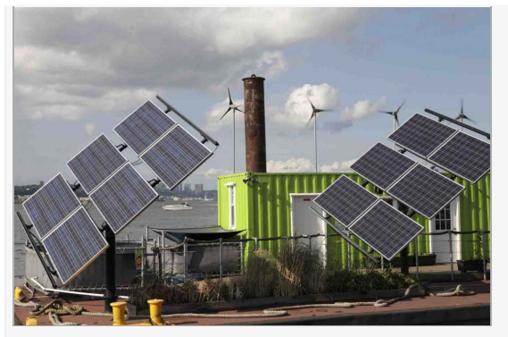
Solar panels and wind turbines are features on a barge in New York's Hudson River. In the 21st century electric utilities are going to have to change how the grid is planned, constructed and operated, reports the U.S. Dept. of Energy. The Smart Grid will provide the capability for regulatory provisions to buy back power generated by residential and commercial customers.

another piece of the Smart Grid puzzle is plagued by difficulty. How are utilities and their customers going to be able to monitor and control successfully in real time if all the systems don't interoperate seamlessly?