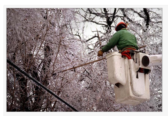
Downed power lines are cleared of ice after a winter storm in Minnesota. Today's grid is focused on outages rather than power quality problems.

Optimizes assets and operates efficiently – Today's grid has minimal integration of limited operational data with Asset Management processes and technologies. Siloed business processes. Time based maintenance. The Modern Grid has greatly expanded sensing and measurement of grid conditions. Grid technologies deeply integrated with asset management processes to most effectively manage assets and costs. Condition based maintenance."