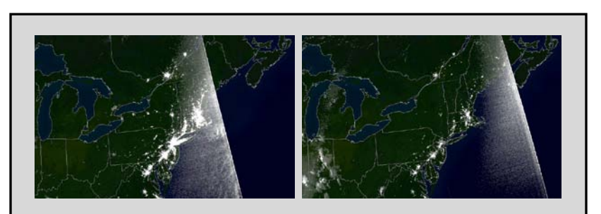
NOAA satellite imagery of lights at night the day before and the night of the Northeast Blackout of 2003.

led to the collapse of the grid in eight states and two Canadian provinces. The "Northeast Blackout of 2003" ultimately affected 55 million people, cost billions of dollars, contributed to six deaths in New York City, and led to four million people in Detroit being under a "boil water" alert for four days.